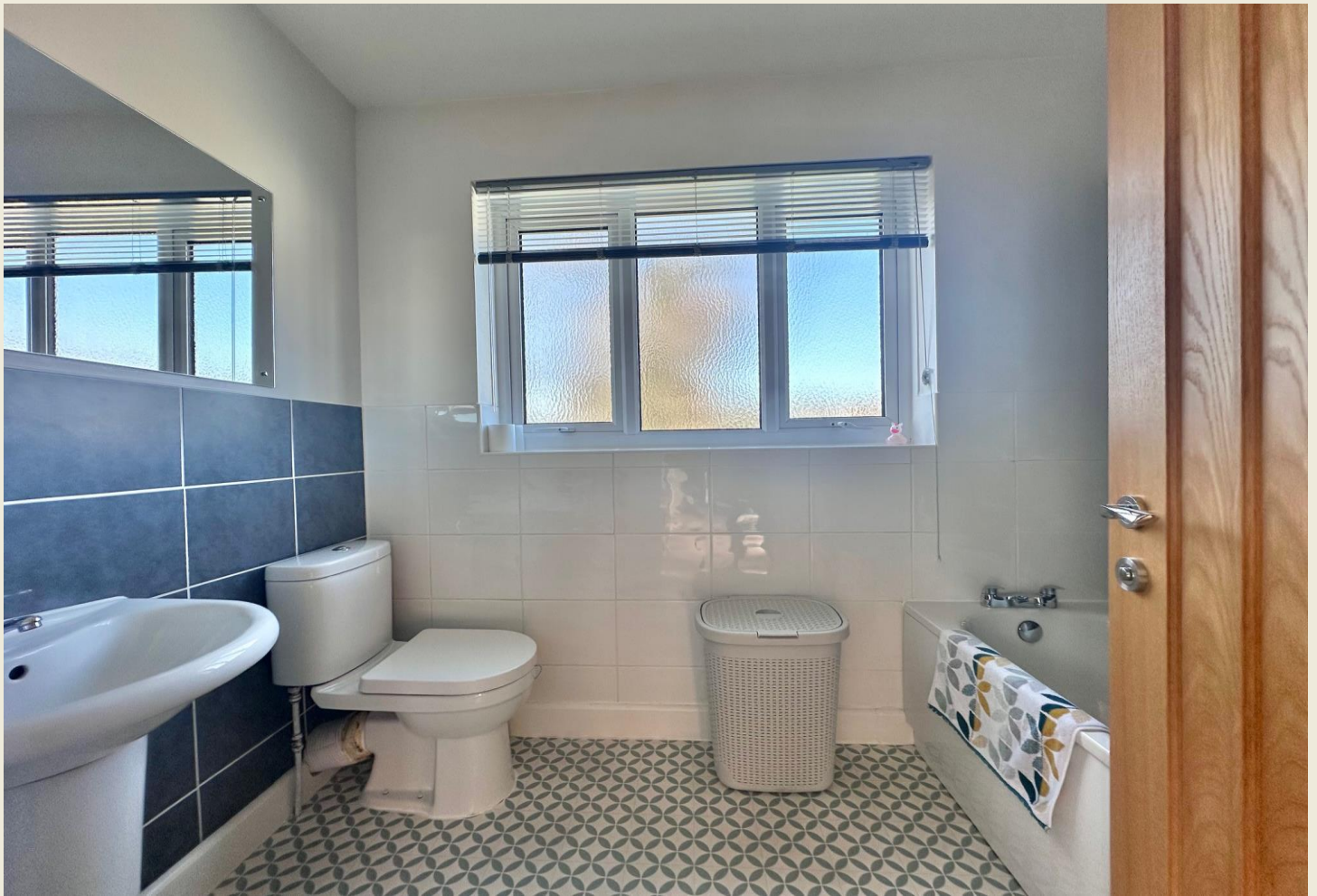
FAMILY BATHROOM 5'7 x 8'3