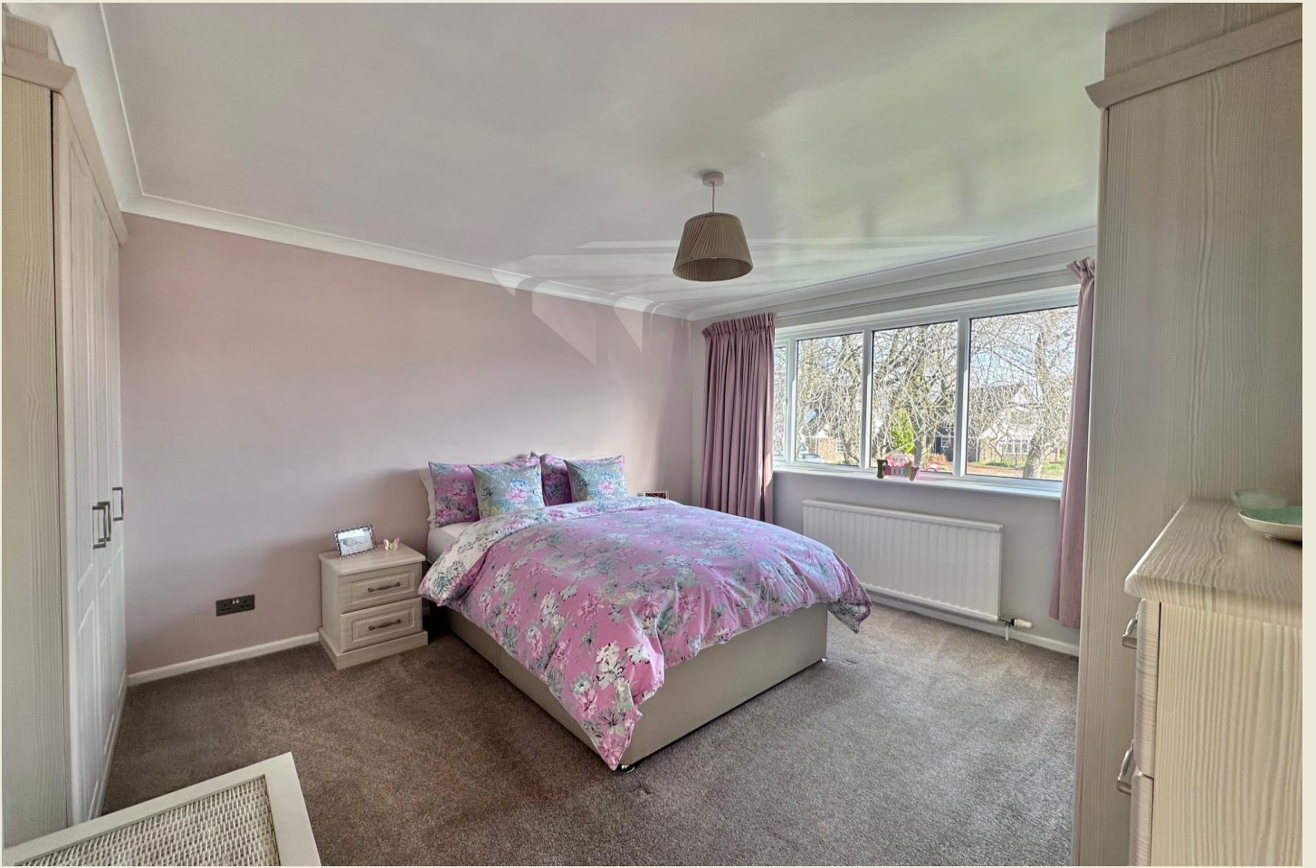
BEDROOM ONE 14'2 max x 14'8 max