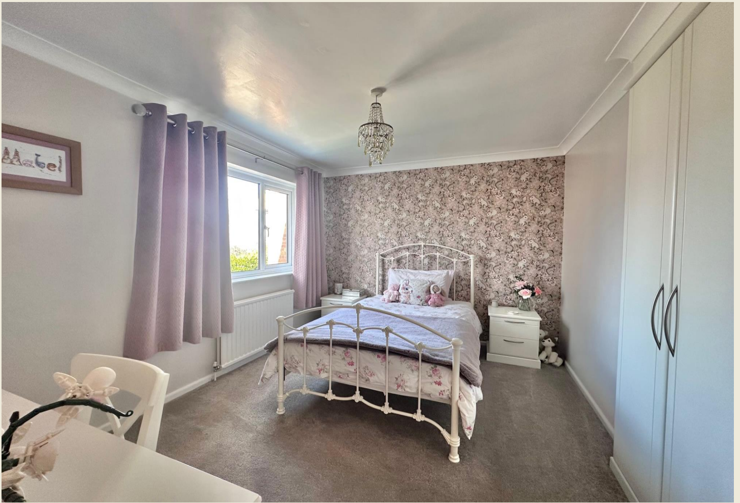
BEDROOM TWO 11'4 max x 14'8 max