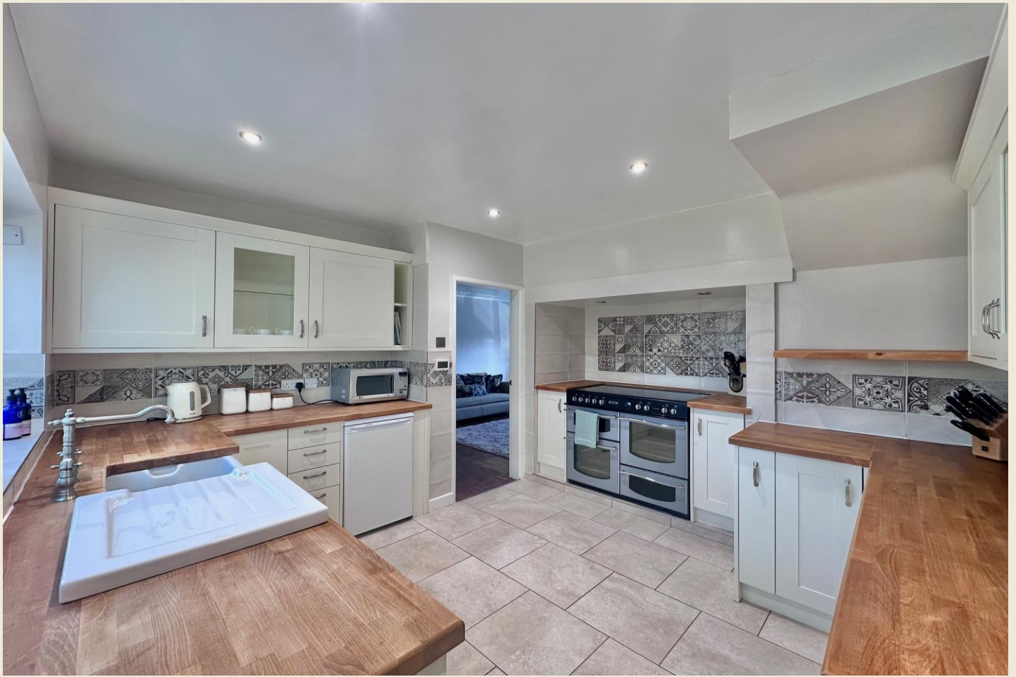
KITCHEN 12'0 max x 11'9