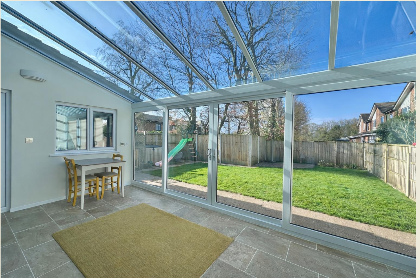
GARDEN ROOM 9'10 x 16'9