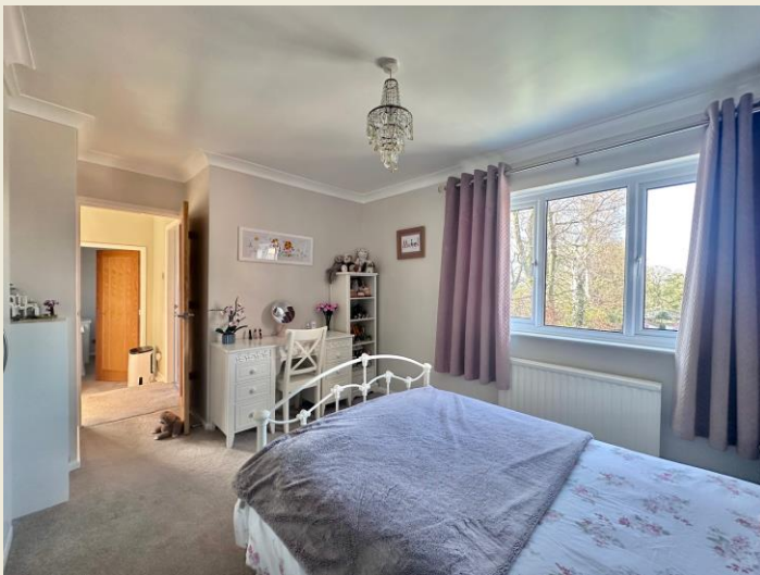
BEDROOM THREE 8'11 x 8'6