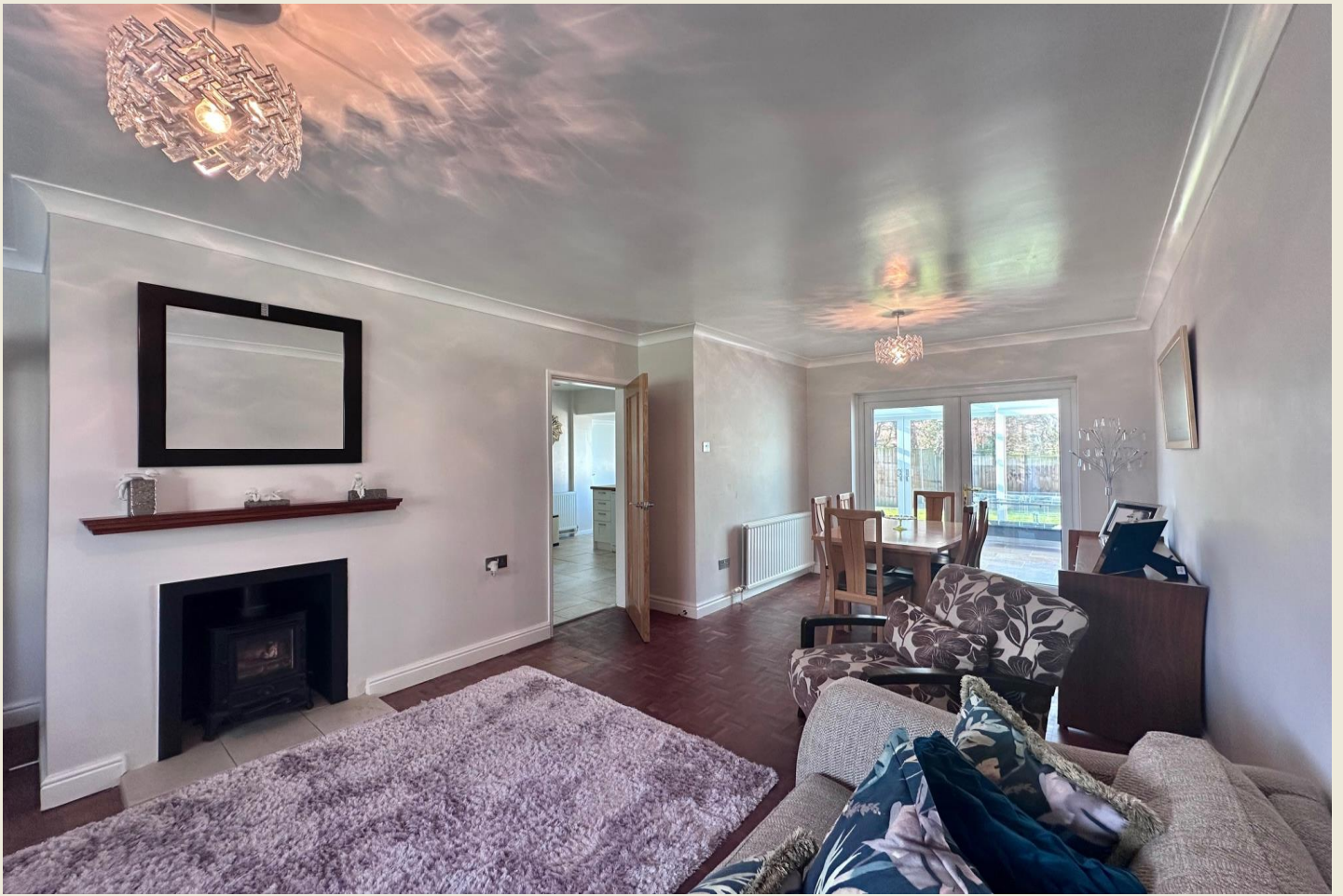
LIVING DINING ROOM 23'10 x 13'10 max